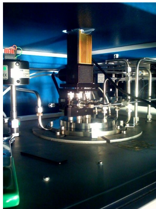
Figure 1: kSA RateRat Pro installed onto multi-wafer TSSE CCS MOCVD System

Many of today's optoelectronic and high-speed electronic device materials are epitaxially grown with advanced MOCVD systems originally manufactured by Thomas Swan Scientific Equipment (TSSE, now part of the Aixtron MOCVD group). These systems had complex, non-integer, rotational gearing ratios which made accurate in-situ monitoring during growth impossible. The ability to synchronize data acquisition during growth on these systems has been limited until now. K-Space has developed a solution for integrating kSA RateRat 532nm laser-based reflectivity system onto these the CCS MOCVD systems for real-time growth monitoring. This now paves the way for utilizing reflectivity based in-situ monitoring, a proven and indispensable tool for real-time monitoring of thickness, growth rate, optical constants (n,k), and surface roughness.